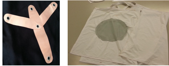
Fig. 2. (a) The PCB shape in a Kapton polyimide film, attached to fabric using Anorak snaps. (b) Double layer with mesh fabric to adjust the PCB in the Wrap top.