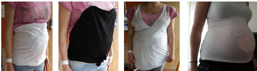
Fig. 3. Garments, from left to right: Belly band, Belly belt, Wrap top and Shirt

Based on the requirements, four prototypes were developed and evaluated (Figure 3).